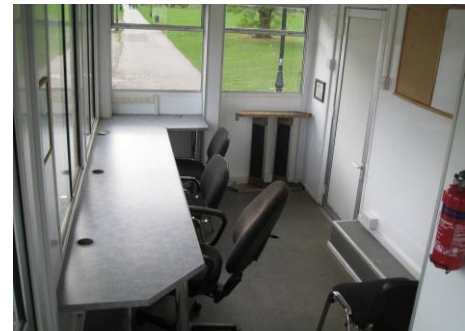
Fig 1. Ground floor