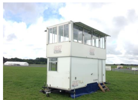
Fig 2. Rear view